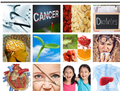
Editorial calendar is subjected to changes. - Editor: Carmen, Jia Wen Loh